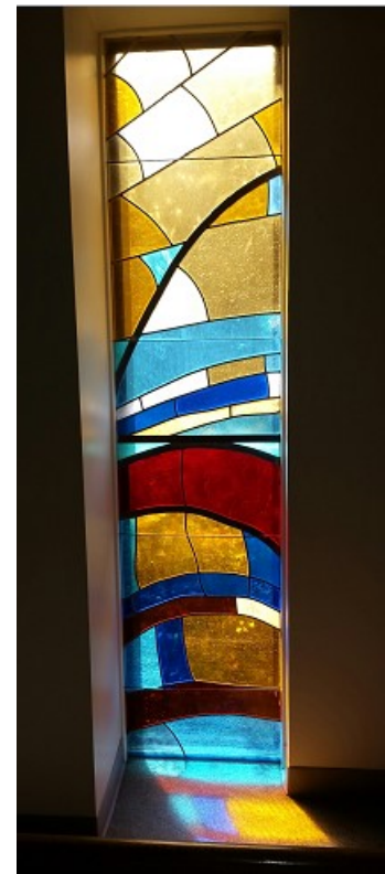
One of the rear windows designed by Ruth Goliwas of Art & Design

Blue , as the color of the sky, has long symbolized heaven and heavenly love. Red is a symbol for fire and is used during the season of Pentecost which commemorates the coming of the Holy Spirit. Yellow can be an emblem of the sun and divinity associated with sacredness.