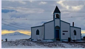
Chapel of the Snows, Antarctica One of seven churches on the continent