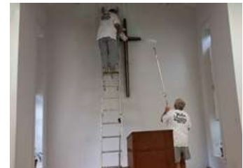
Painting Fellowship Hall

The BUILDING AND GROUNDS COMMITTEE reports that the painting of the Fellowship Hall interior is complete. The fresh new look delighted the congregation when they met on the fifth Sunday in October for Parkway's pot luck lunch. Damaged ceiling tiles in the Fellowship Hall and the